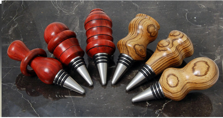
Alan Zenreich Stoppers