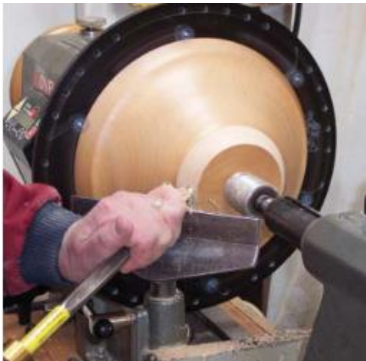
Turning the foot of the bowl. The tailstock was removed for final turning away of the little tenon in the center and for final sanding.

The bowl was now ready to reverse and turn the foot. I would have normally reversed the bowl onto my vacuum plate made by Vicmarc that I've had for a number of years. However, the Rim Chuck was easier to set up and worked very well. Again, for safety sake, I used tailstock support; something that I do with any reverse turning method, whether it is a jam chuck, a vacuum chuck, a Longworth Chuck, or the Rim Chuck.