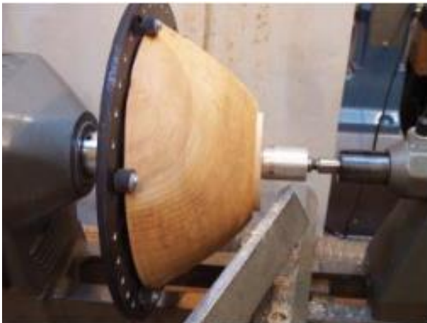
Using a Rim chuck to turn the foot of my rough turned bowl.

I never trust any of the reverse-chucking devices completely and normally give additional support with my cup-shaped live center as shown in the photo.