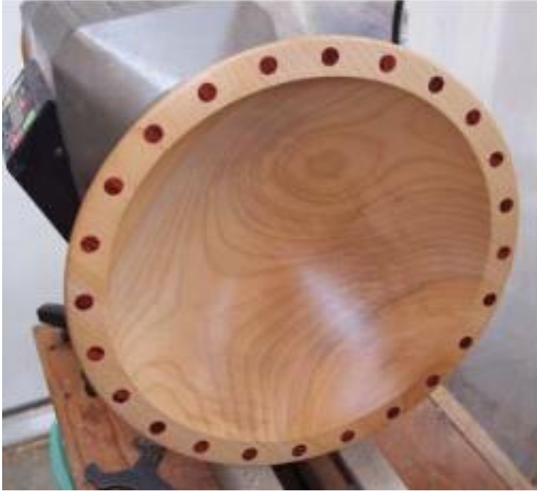
A view of the top of the bowl while still mounted on the lathe.

The bowl was now ready to reverse and turn the foot. I would have normally reversed the bowl onto my vacuum plate made by Vicmarc that I've had for a number of years. However, the Rim Chuck was easier to set up and worked very well. Again, for safety sake, I used tailstock support; something that I do with any reverse turning method, whether it is a jam chuck, a vacuum chuck, a Longworth Chuck, or the Rim Chuck.