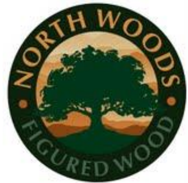
Happy Woodworking to you! Les and Susan!

Susan & Les at North Woods service@nwfiguredwoods.com http://www.nwfiguredwoods.com/ 56752 SW Sain Creek Rd Gaston Or 97119 PO Box 808 Forest Grove OR 97116 503-357-9953 800-556-3106