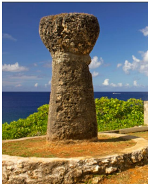
Photo of Latte Stone