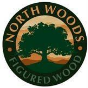
Happy Woodworking to you! Les and Susan!

Susan & Les at North Woods service@nwfiguredwoods.com http://www.nwfiguredwoods.com/ 56752 SW Sain Creek Rd Gaston Or 97119 PO Box 808 Forest Grove OR 97116 503-357-9953 800-556-3106