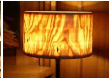
Finished lamp shade

June 25 th – 28 th – AAW Symposium, Pittsburg, PA