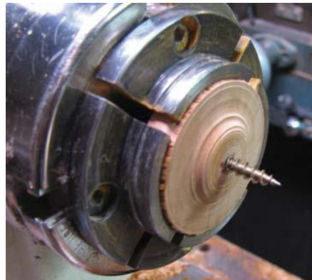
Homemade screw chuck to hold the blank for turning.

Make a screw center for your lathe that is appropriately sized for this project. I take a scrap of wood that fits into my chuck and true its face. I then drill clear through the piece at its center with a 5/32 drill. Remove this blank from the chuck and countersink the backside of the hole so that a #12 flat head screw will seat firmly. I typically use a 1" by #12. You may need to deepen the countersink so that \frac{1}{2} to \frac{5}{8} of an inch of the screw protrudes through the front of the blank. I then put epoxy on the head to hold the screw in place.