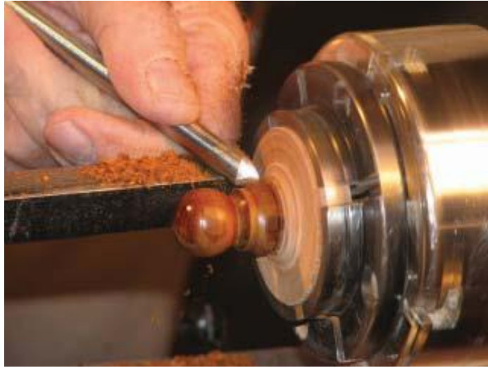
Turning the wood to shape, in this case a neat knob.

Once the epoxy has cured, the small size screw chuck is ready to use. Remount it into your chuck. Screw on your wood blank and turn to a shape of your choosing using gouge, skew and or scrapers.