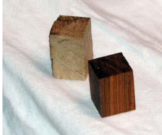
Samples of stock to be used.

This quick project makes a useful item that everyone seems to need. I begin by purchasing rare earth magnets. The most useful size is just under 1/2 inch diameter (12 mm) and 1/8 inch thick. These can be ordered from most supply catalogs, but I get mine from my local craft supply store. They are about 1/2 the price as the mail order sources, and the magnet is the major cost in making this project.