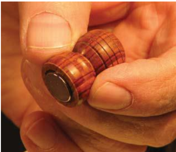
The finished refrigerator magnet

Apply a small amount of epoxy or super glue to the magnet recess and then press in the clean magnet. The project is complete when the glue has cured.