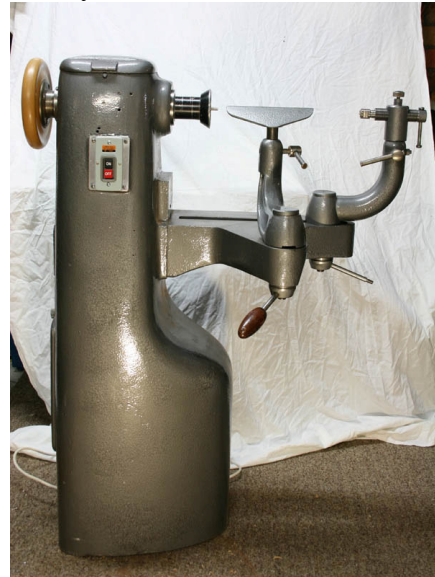
UNION GRADUATE LATHE

of. Yes I am an Anglophile and I haven't even mentioned Callard & Bowser toffees or Downton Abbey.