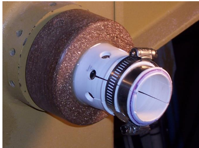
Dick Sing style egg chuck