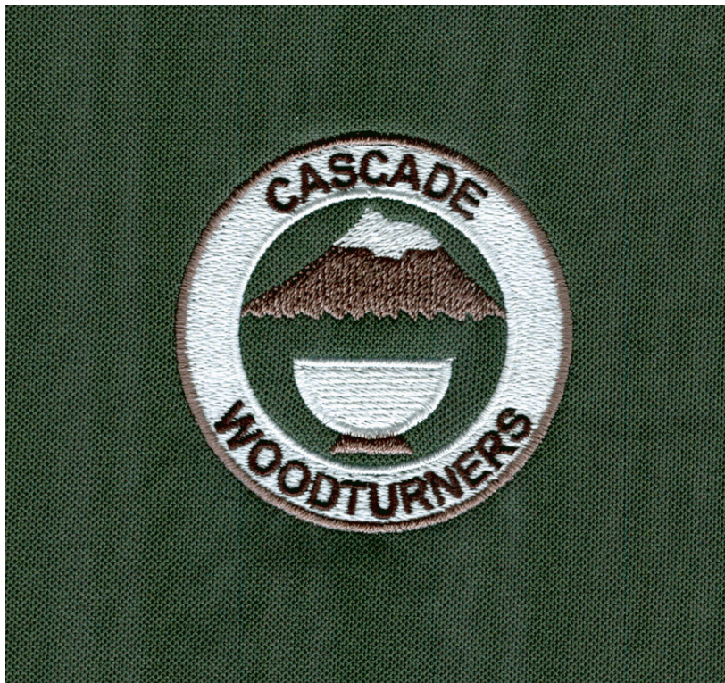
Cascade emblem for clothing items – Order at the February meeting

Would you like to be on the "MENTOR" list on the web site? You could be a resource for newer turners. Contact a Board member to be added and list your areas you prefer to help with.