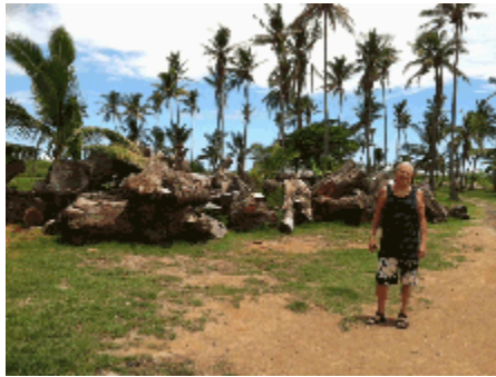
Skip on Fiji Island