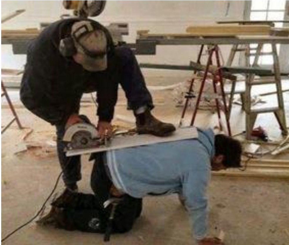
Safety First... please