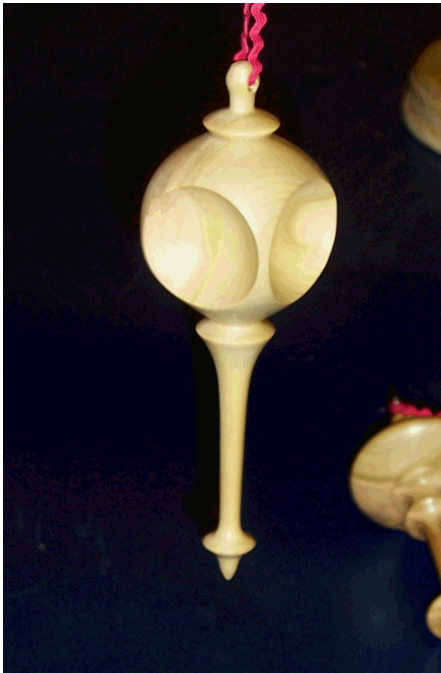
Gary Dahrens' multi position turned ornament