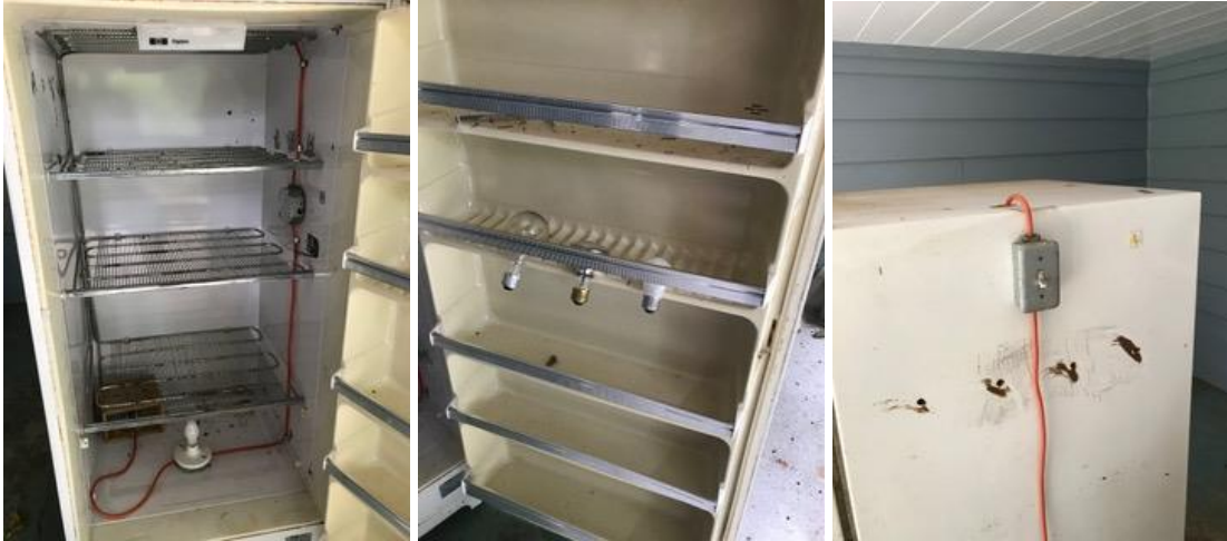
Air Holes and Switch

FREE: Free, for the hauling off, a wood drying Kiln. I have removed all the working parts of the freezer and installed a light bulb socket, fan, and thermostat. A second way to adjust your heat is to change the light bulb. Air holes are drilled on both sides and top and bottom. Dimensions are 28" W x 60" H x 28.5 deep. This unit is ready to go, just plug-in Contact Russ Coker racoker@comcast.net 503 701 2508