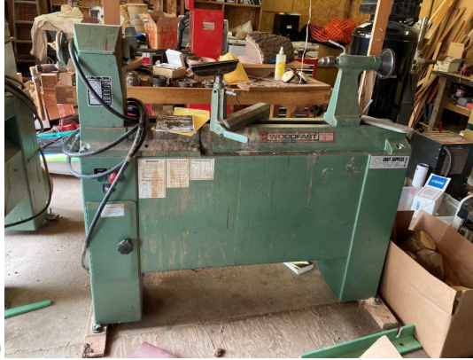
Woodfast lathe model m910 $2000