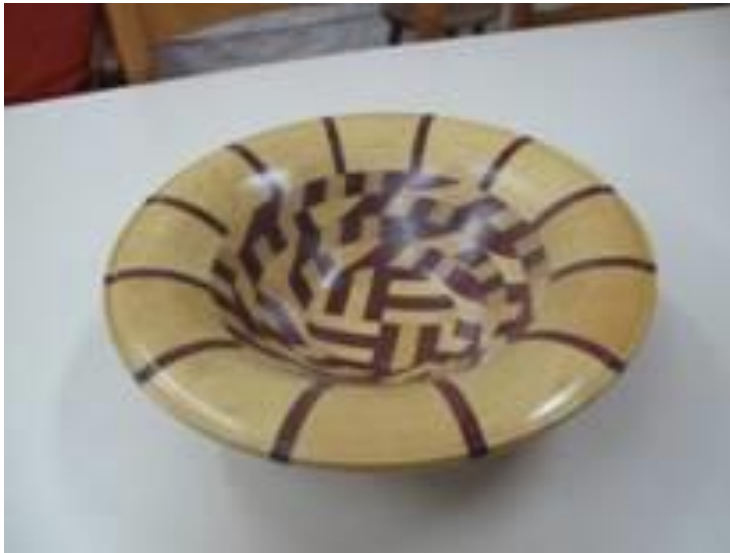
Layered turning from Amaranth and Pau Amarello