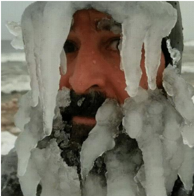
Stay frosty, my friends!

The weather is cooling down, our shops are calling to us, and the holiday season is approaching. Many of us will be making things we want to finish before the holidays.