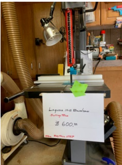
A Laguna 14/12 bandsaw for $600.00