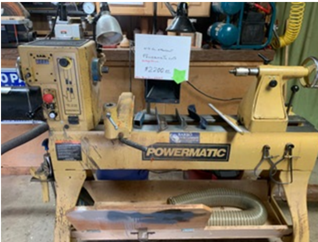
The lathe is a Powermatic 3520B with and attached vacuum for $2200.00

Well, where do I start? I am hoping this finds you all well with all that we have been undergoing. What a time, Huh? Well, I have hung up my gouges and must call it quits, just can't do it anymore. Therefore I am putting up for sale, and at good prices, my collection of turning tools and machinery. I wish to offer them for sale to any of the members of the Turning Club I am very fond of, " Cascade Woodturners".