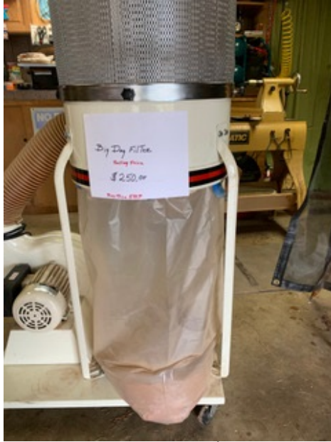
Jet Dust Collector For $250.00.