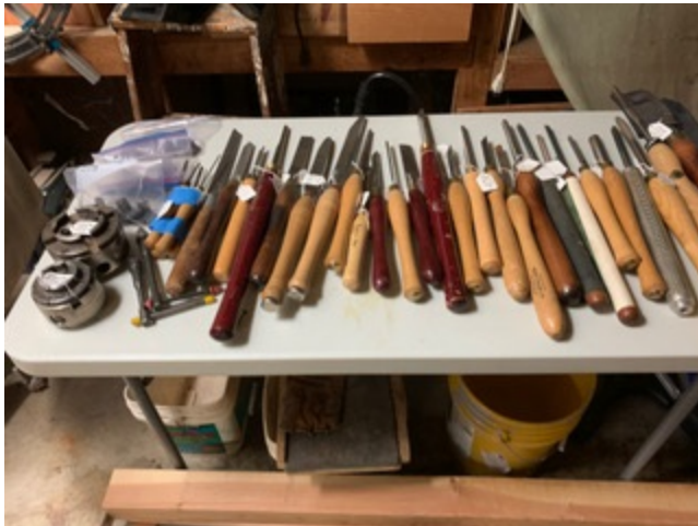
An assortment of turning tools and chucks at very low prices