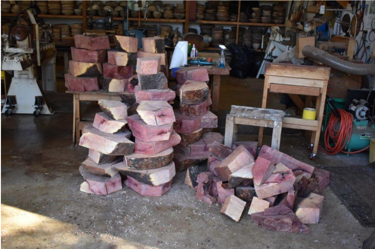
Some of the chain sawed blocks