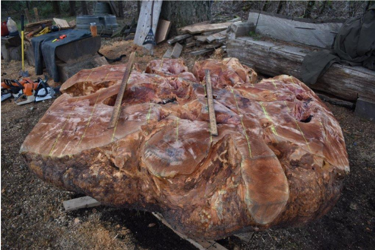
Stump turned upside down so it can be pressure washed and marked for cutting