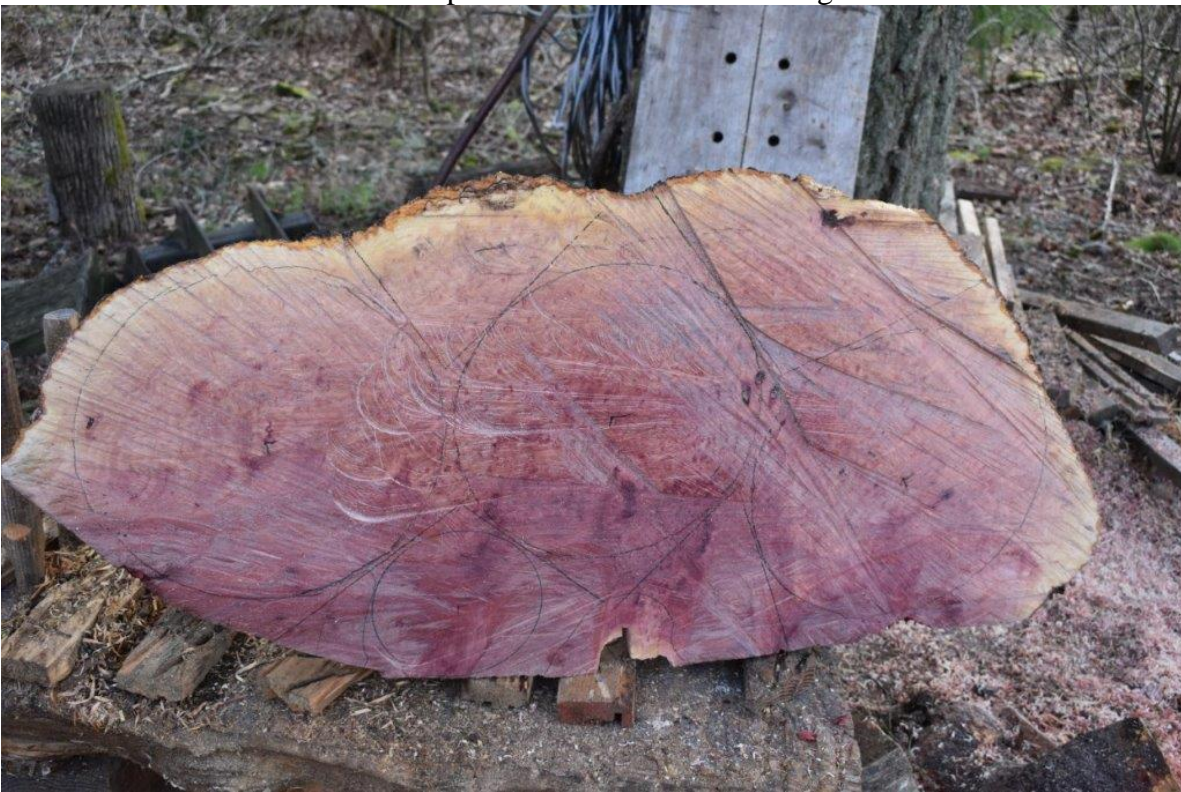
This end slab has the bowls drawn on it. The straight lines are where I will use the small chainsaw to cut the slab apart