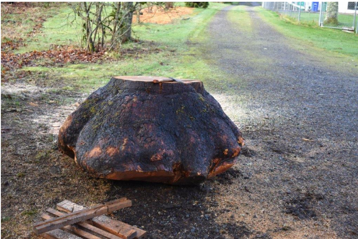
This madrone burl is approximately 5' x 7' and weighs about 3000lbs

Here is a sequence of photos that show how bowl blanks are cut out of a big burl.