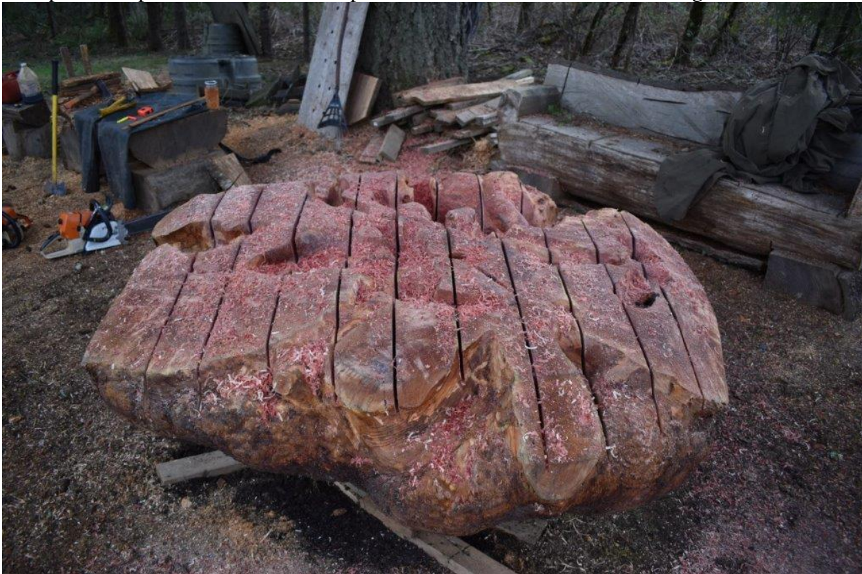
Lay out of the slabs 5" to 7" thick