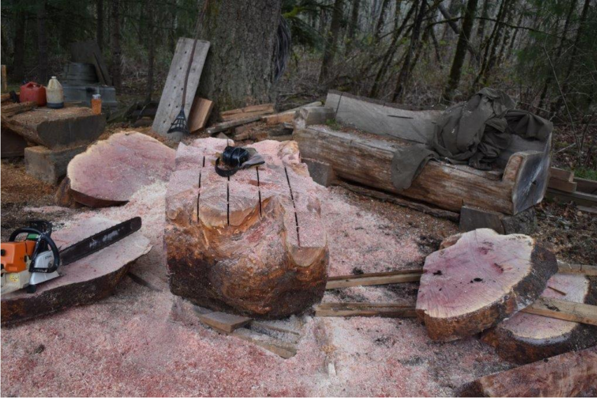
One slab is cut off each side to keep the burl balanced for cutting