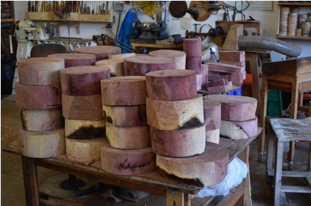
The bowl blanks bandsawed and ready to rough turn