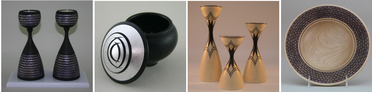
A few examples of Eli's work

If you are interested in signing up for one of the classes contact Dale at 503-661-7793 or at woodbowl@frontier.com .