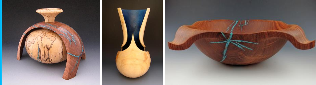
Examples of some of Craig’s turnings. See his website for more.