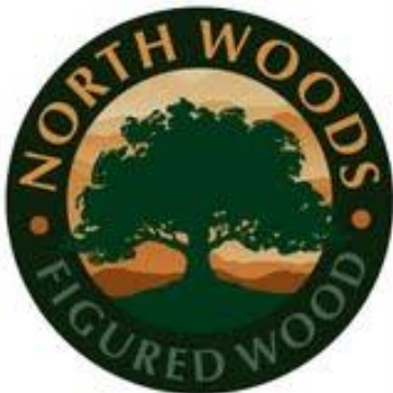
Happy Woodworking to you! Les and Susan!

Susan & Les at North Woods service@nwfiguredwoods.com http://www.nwfiguredwoods.com/ 56752 SW Sain Creek Rd Gaston Or 97119 PO Box 808 Forest Grove OR 97116 503-357-9953 800-556-3106