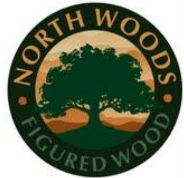
Happy Woodworking to you! Les and Susan!

Susan & Les at North Woods service@nwfiguredwoods.com http://www.nwfiguredwoods.com/ 56752 SW Sain Creek Rd Gaston Or 97119 PO Box 808 Forest Grove OR 97116 503-357-9953 800-556-3106